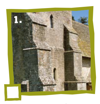
1. Small windows – with curved arches.